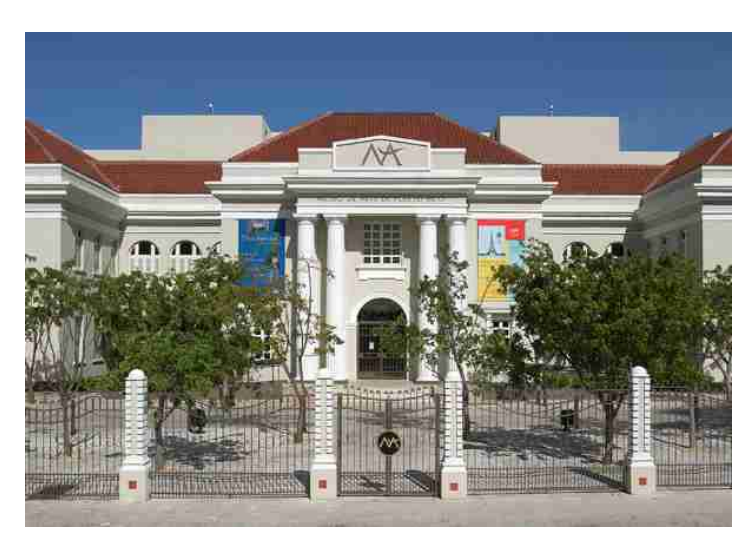
Exterior - Main Entry