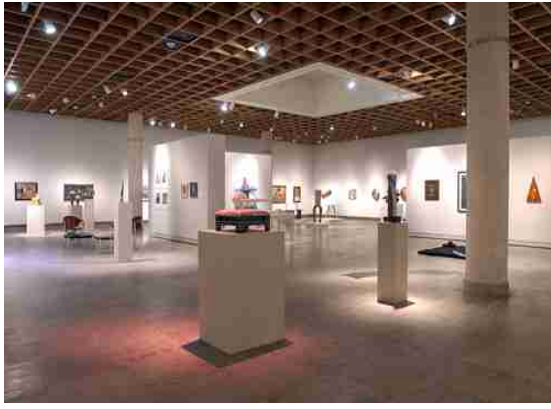
Changing Exhibitions Gallery

The existing 40,000sf building was completely restored with an addition culminating in a 110,000sf museum and education center. The museum provides extensive permanent and changing galleries with an 800 seat theater, food service facilities and a great-hall atrium. Completed in the Spring of 2000, this project is a joint venture with The Museum Group, a local architectural firm in Puerto Rico.