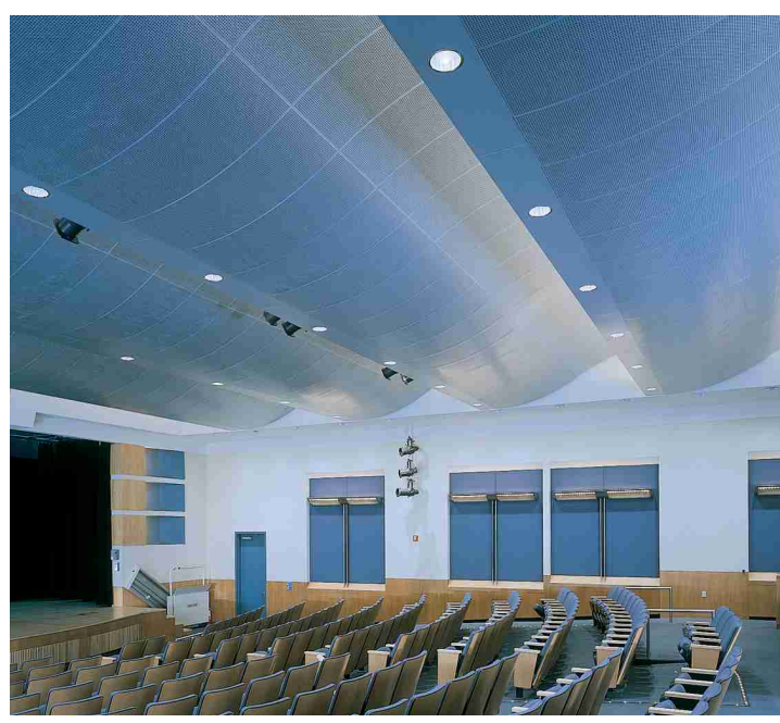
Kaufman and Linder Theatres