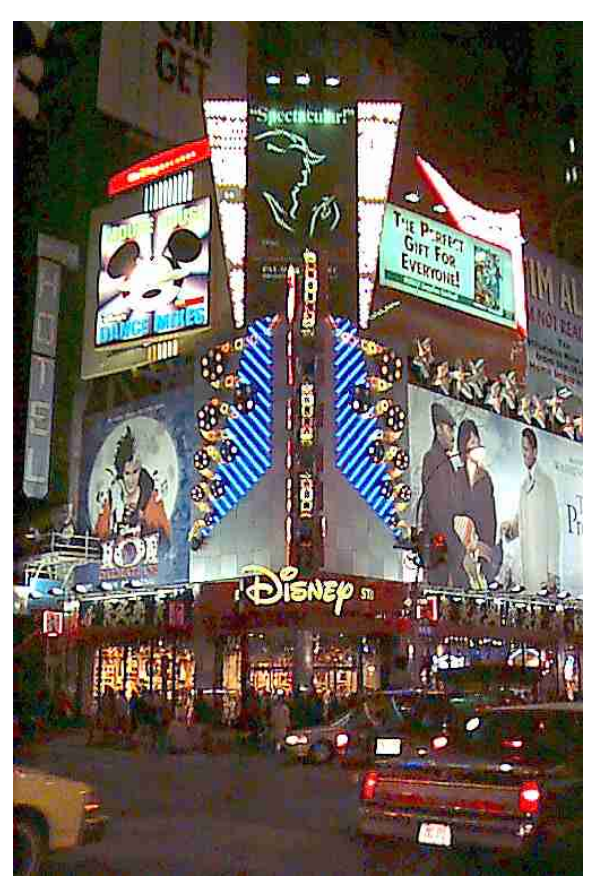
Disney Signage Corner 42nd Street & 8th Avenue

Date of Completion Design (1999) Implementation (2000)