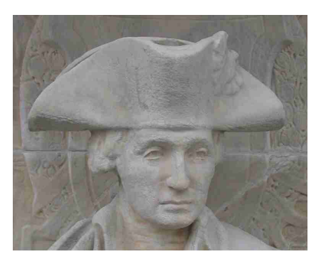
George Washington Commander Sculpture