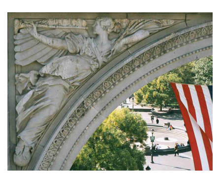
Washington Square Arch Detail