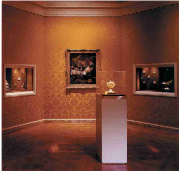
The Linsky Gallery