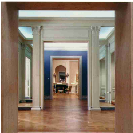
The Linsky Gallery