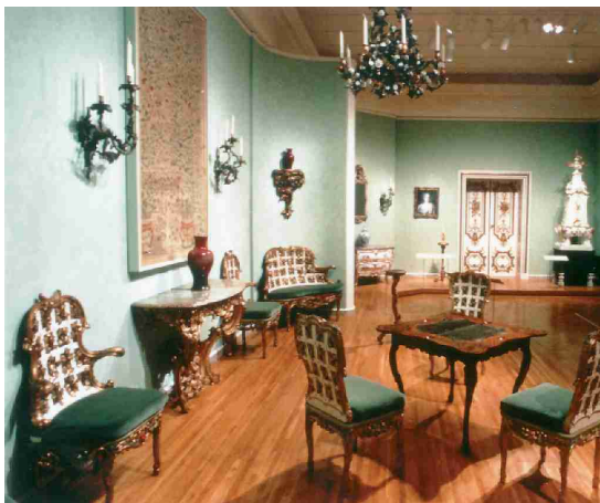
European Decorative Arts Gallery