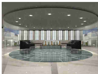
Main Gallery second floor

For the first time, a story-telling museum will use evocative and extraordinary works of art to illustrate the depth of Jewish life, past and present. Utilizing cutting-edge technology, the visitor and user will have an unparalleled opportunity to begin a journey of discovery bringing to life the finest, saddest and even mundane moments of Jewish life and history. Extending over seven floors the museum's four main galleries will be complemented by classroom space, a library, and general public facilities including a restaurant and a museum shop.